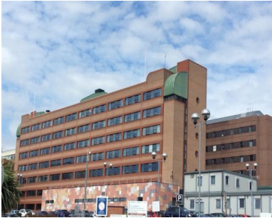
The Royal Gwent Hospital in Newport

There are three centres delivering the BCHI Service and these are located at: