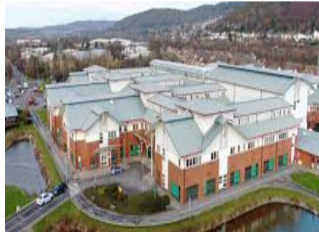
Neath Port Talbot Hospital