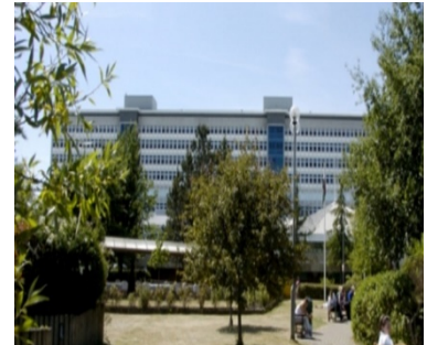
University Hospital of Wales, Cardiff

Services from Cardiff & Vale and Neath Port Talbot are bought and monitored (commissioned) by WHSSC. The service at Aneurin Bevan University Health Board is funded by Aneurin Bevan University Health Board.